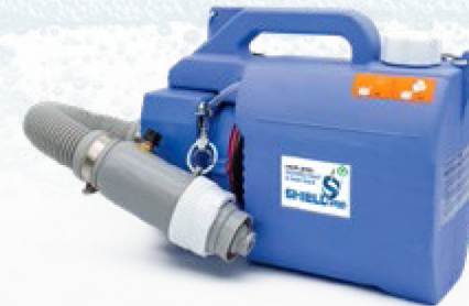
DISINFECTING FOGGER SDME-200-201