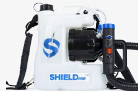
DISINFECTING FOGGER SDME-15002E